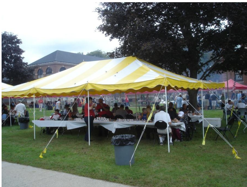
The crowd gathers for the annual Vettes to Vets picnic