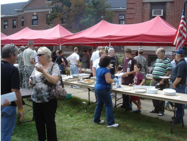
Volunteers and patrons make their way around the food venues

at the Veterans' Administration Hospital in Bedford MA